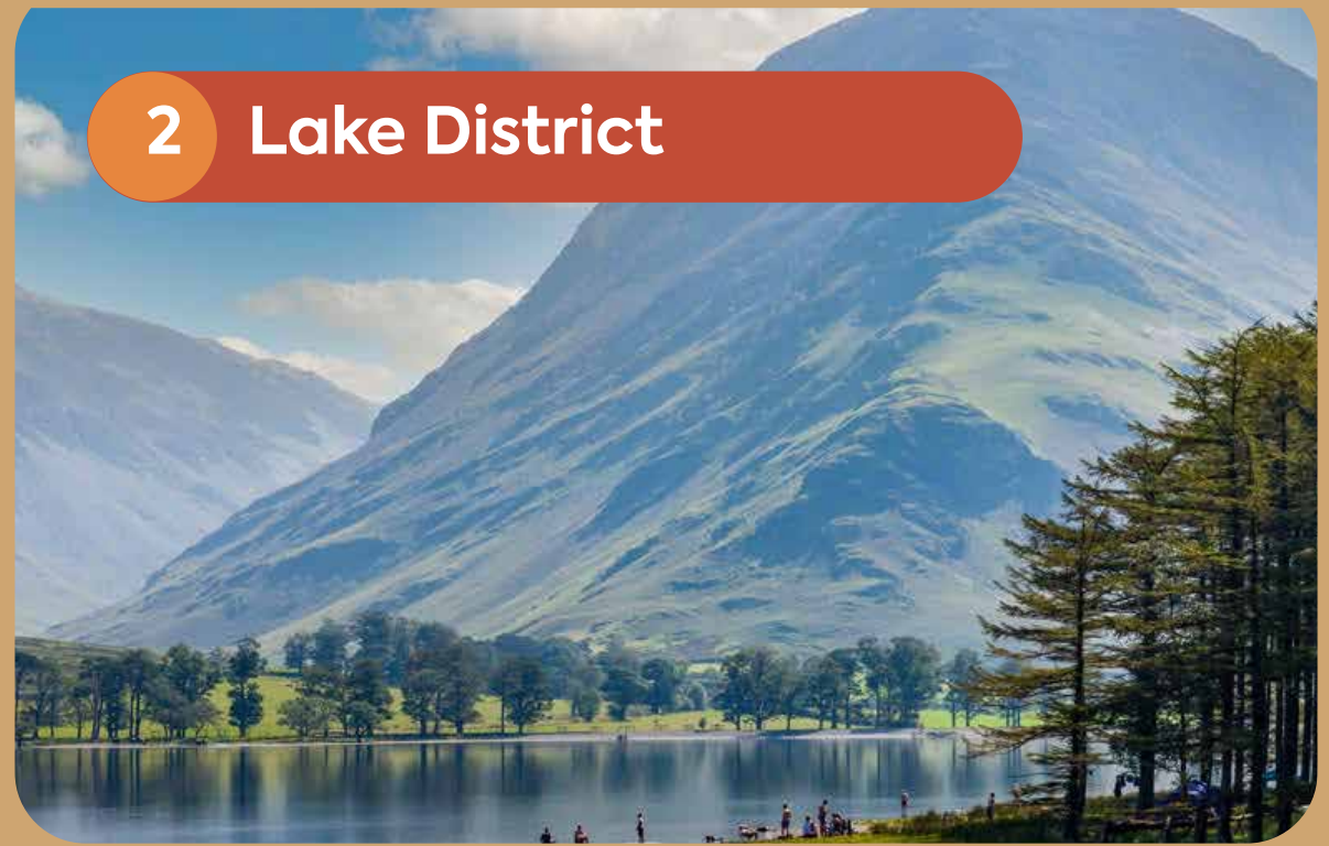
2 Lake District

Famous for golden beaches, charming villages, and a relaxed coastal vibe.