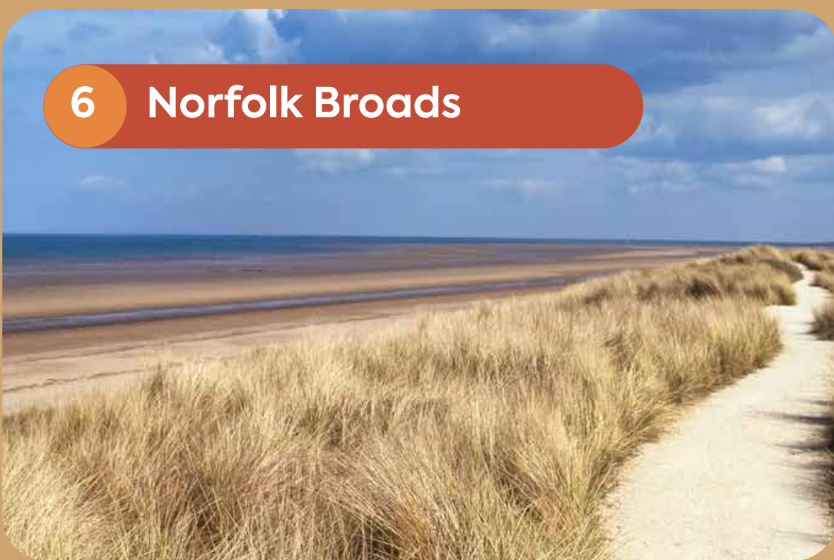
6 Norfolk Broads

Known for its mild climate, sandy coves, and lush countryside.