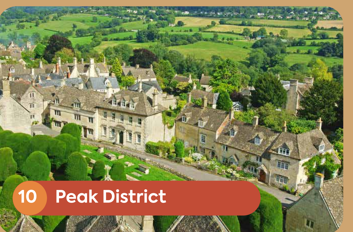
10 Peak District

Blends dramatic landscapes with charming villages and walking routes.