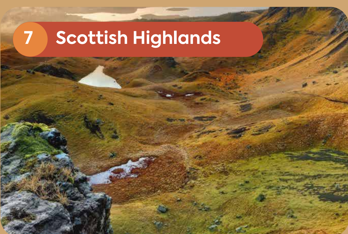
7 Scottish Highlands

Perfect for boating holidays surrounded by serene waterways.