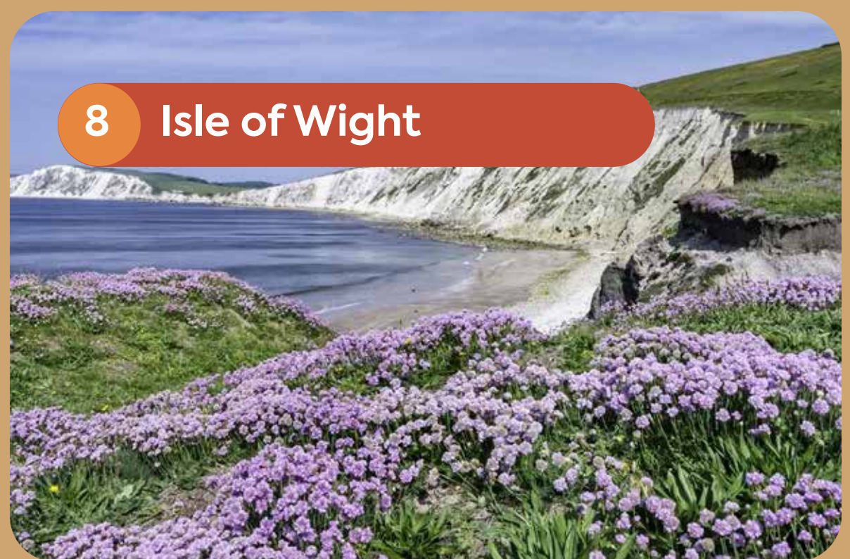
8 Isle of Wight

Enjoy sandy shores, cultural events, and a peaceful island lifestyle.