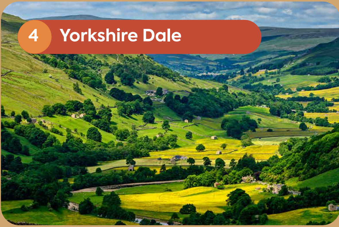
4 Yorkshire Dale

Discover national parks, historic castles, and warm Welsh hospitality.