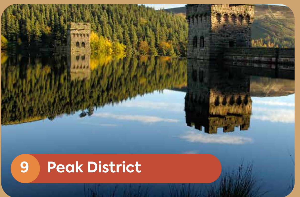
9 Peak District

Enjoy sandy shores, cultural events, and a peaceful island lifestyle.